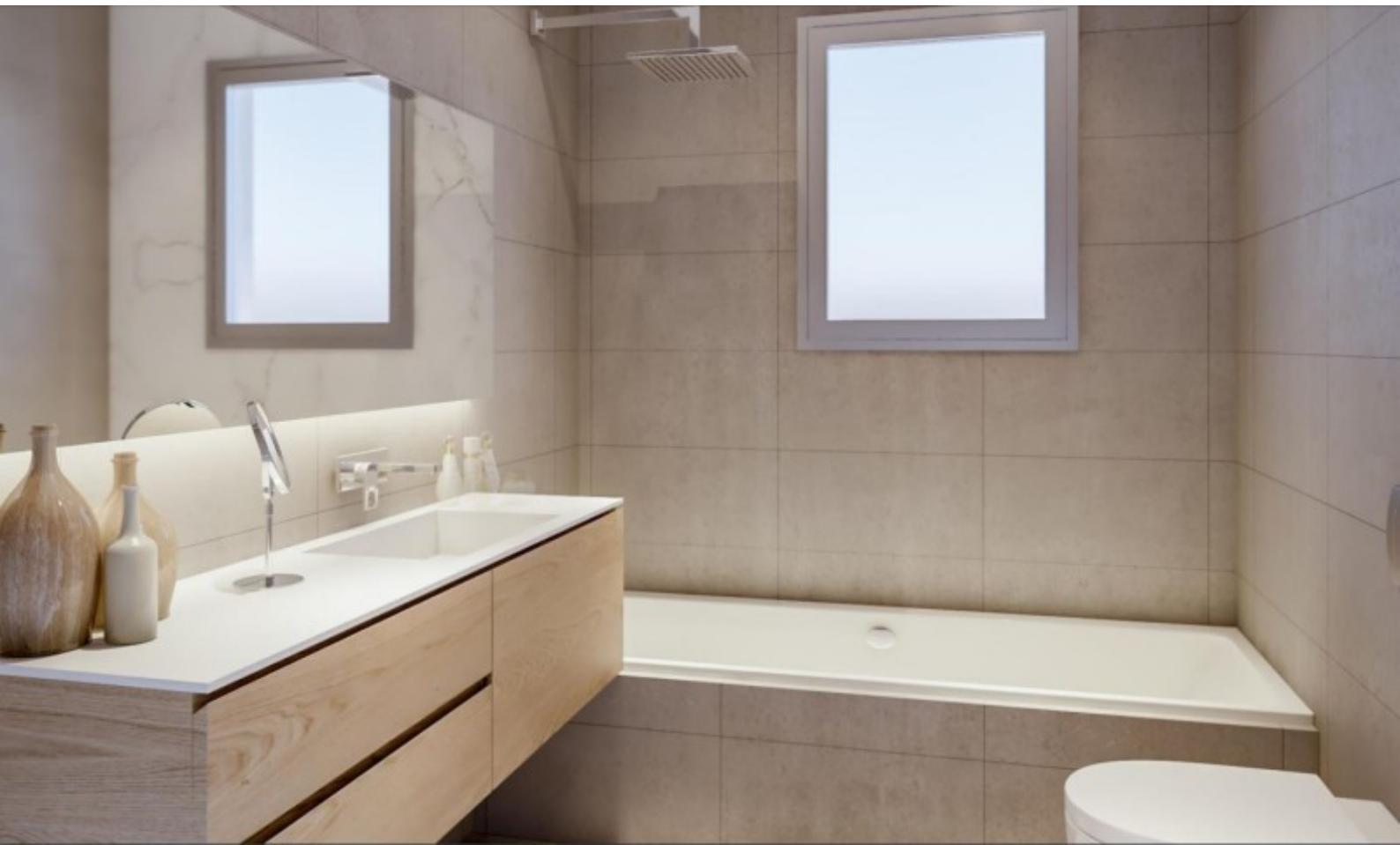
3 Bedroom apartment