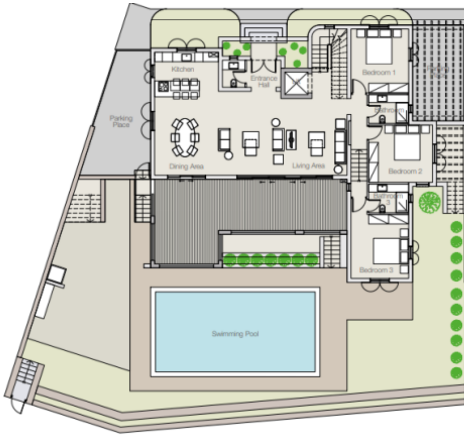
Lower ground floor