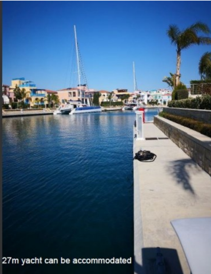
27m yacht can be accommodated