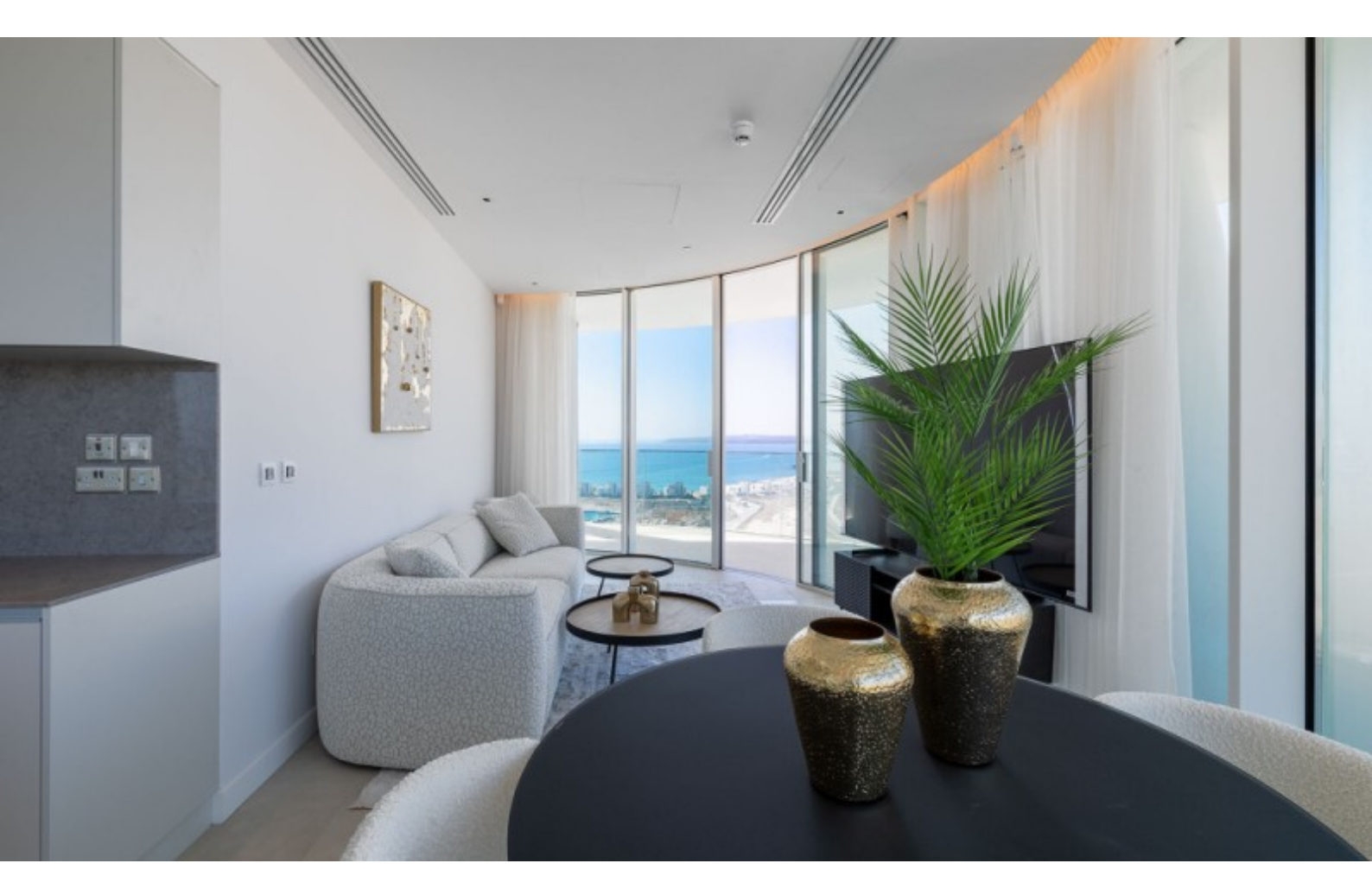
Contact us for more information and private or virtual viewing!