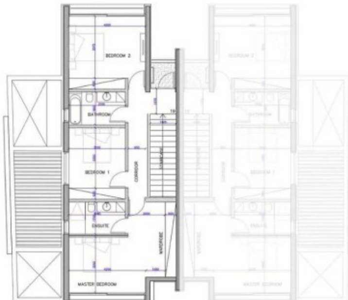
FIRST FLOOR Scale: 1:100