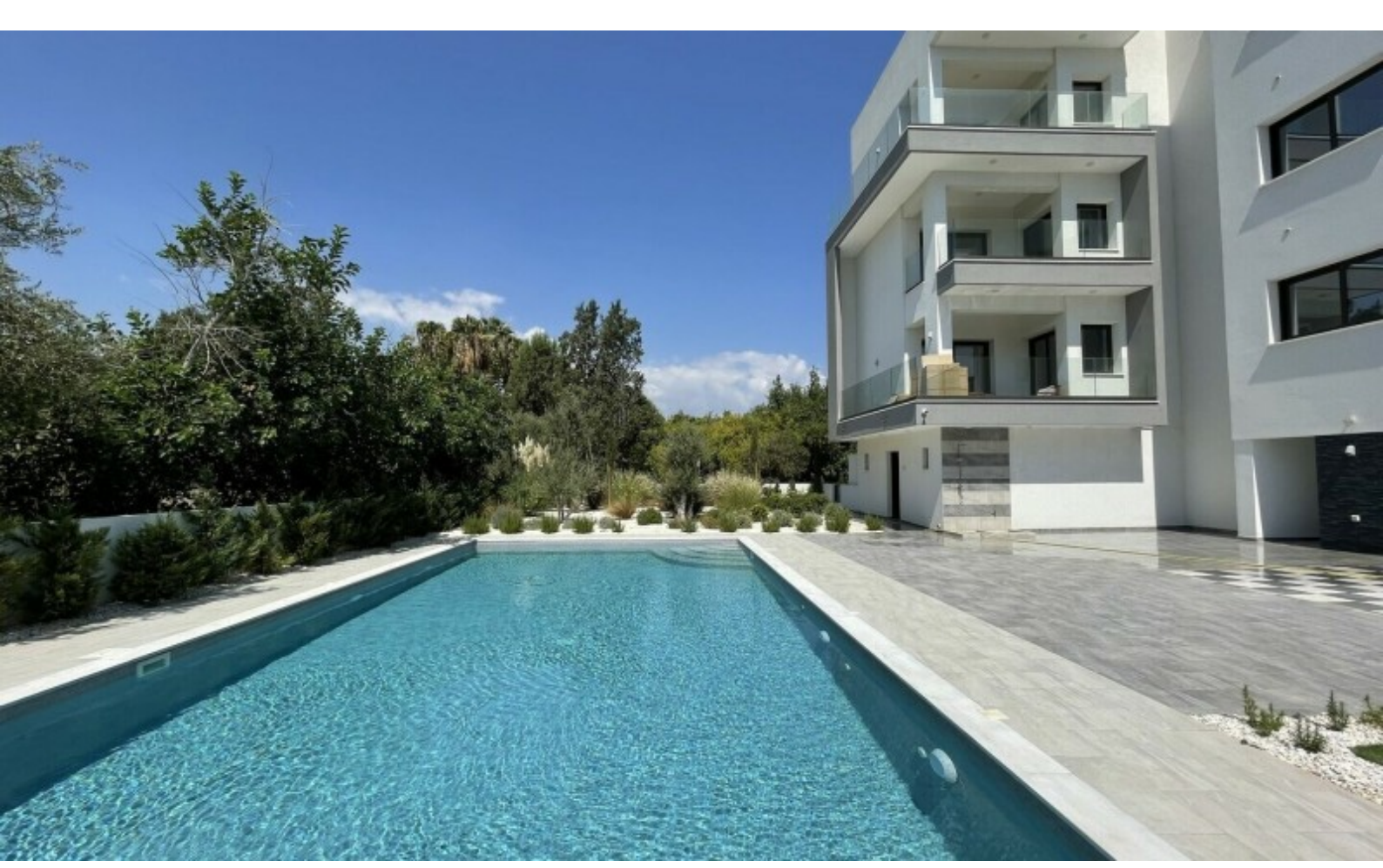
Contact us for full information and for a private viewing!