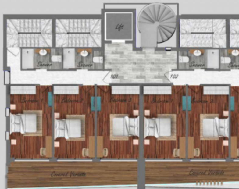
3 Bed Apart. 1st & 2nd Floor