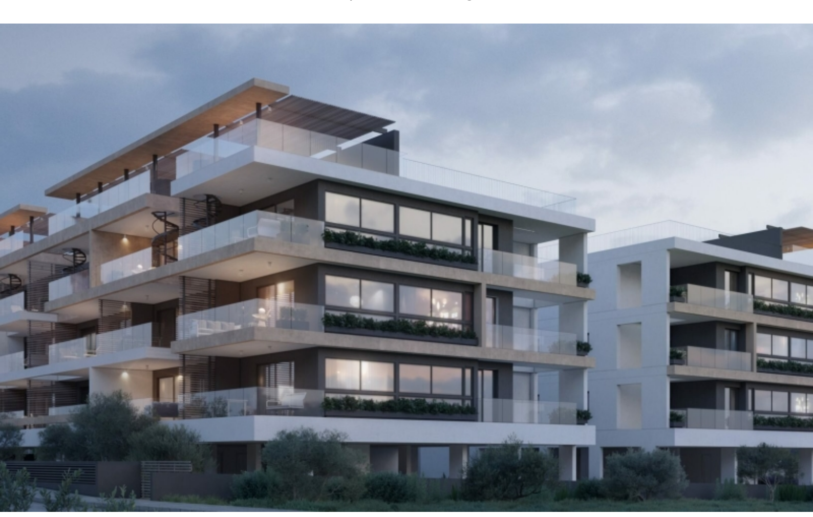
Contact us for full information and a private viewing!