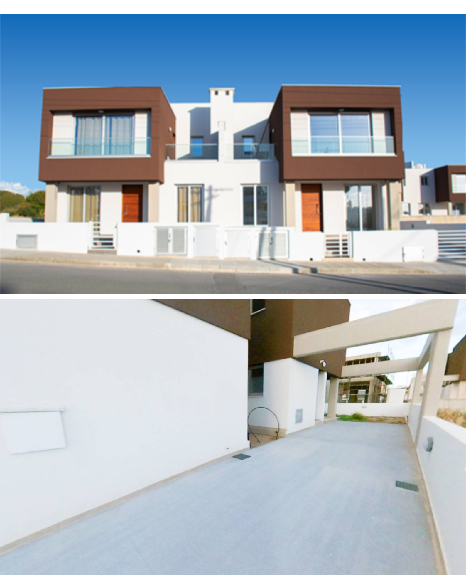
Contact us for full information and for a private viewing!