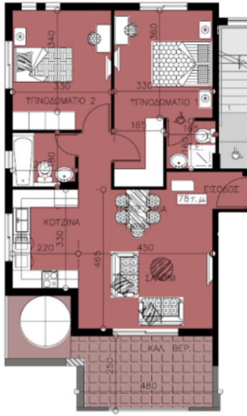
ΚΑΤΩΦΗ 3ΟΥ ΟΡΟΦΟΥ