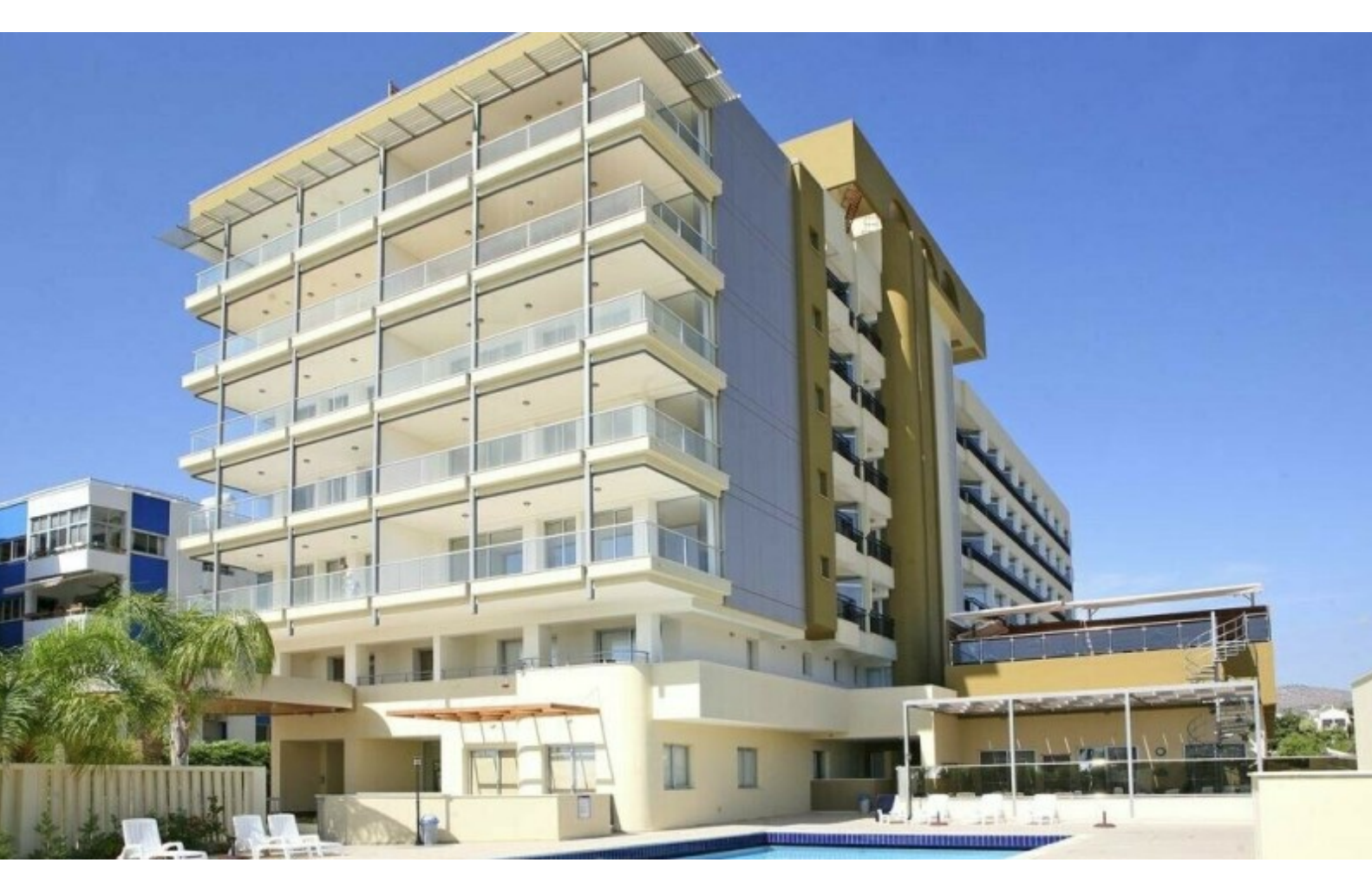
Contact us for full information and for a private viewing!