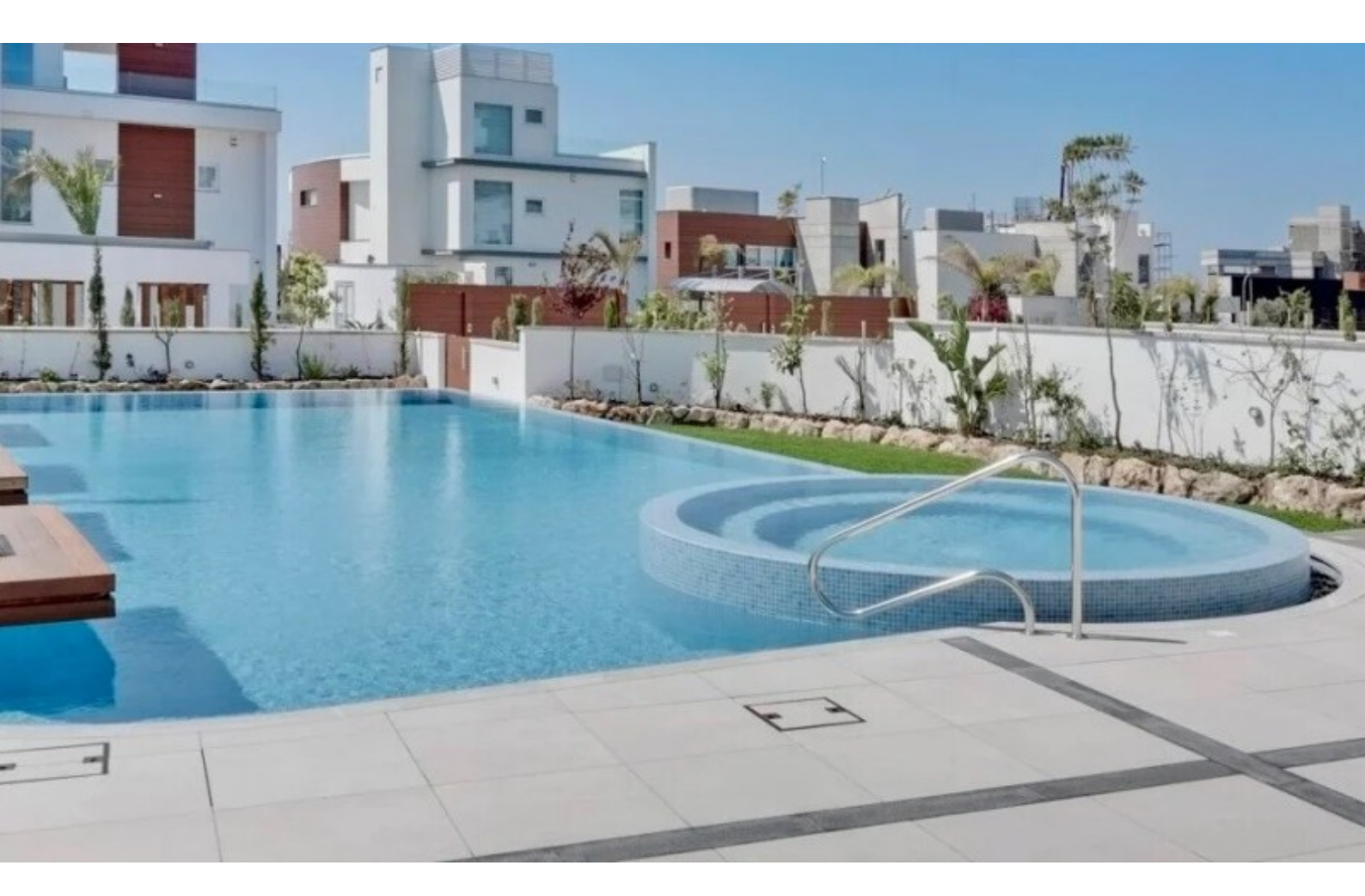
natural surroundings. Contact us for more information!