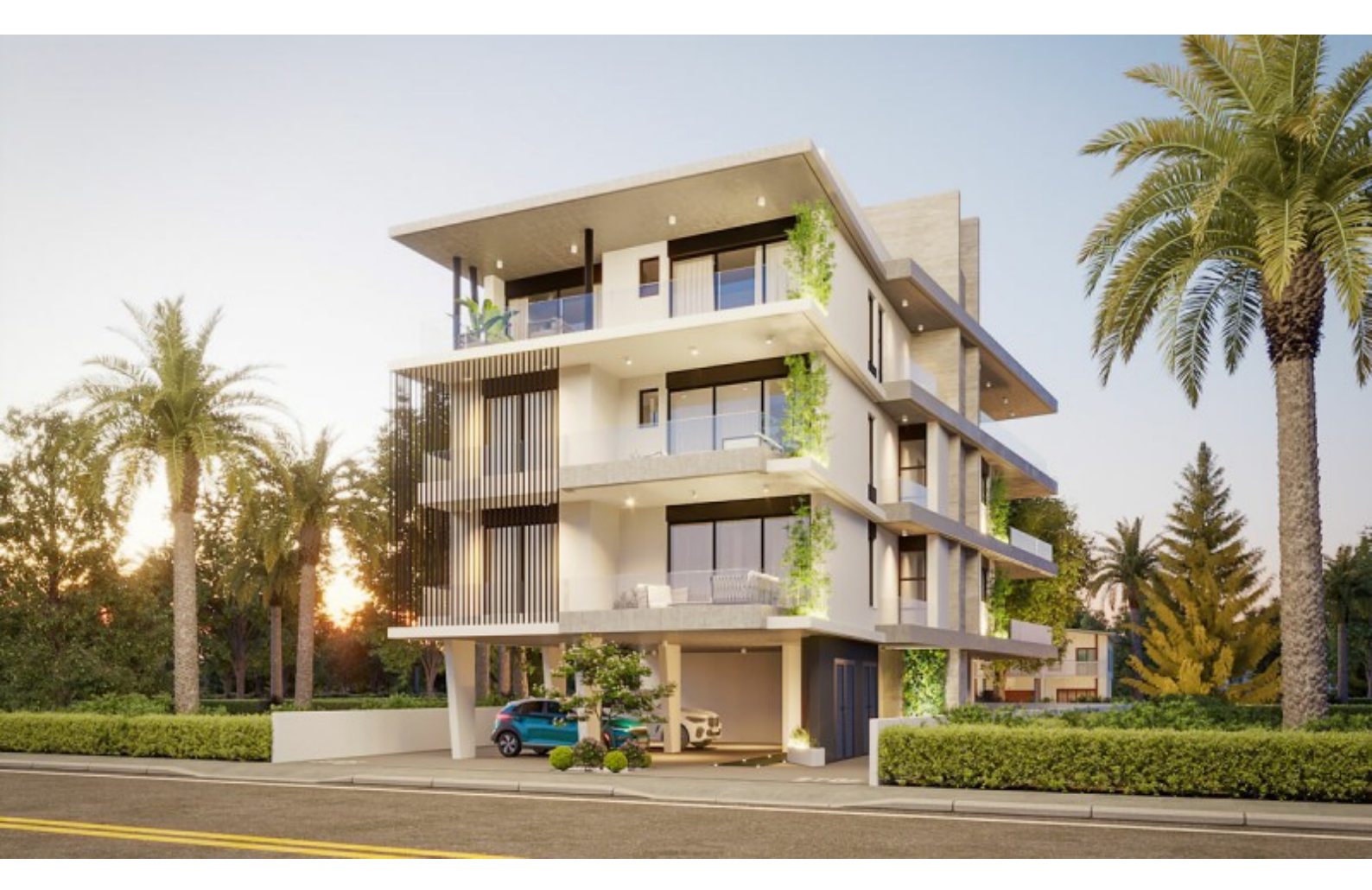
It is excellent for permanent living for a small family Contact us for full information and for a private viewing!