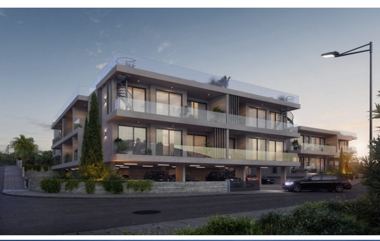
Contact us for full information and for a private viewing!