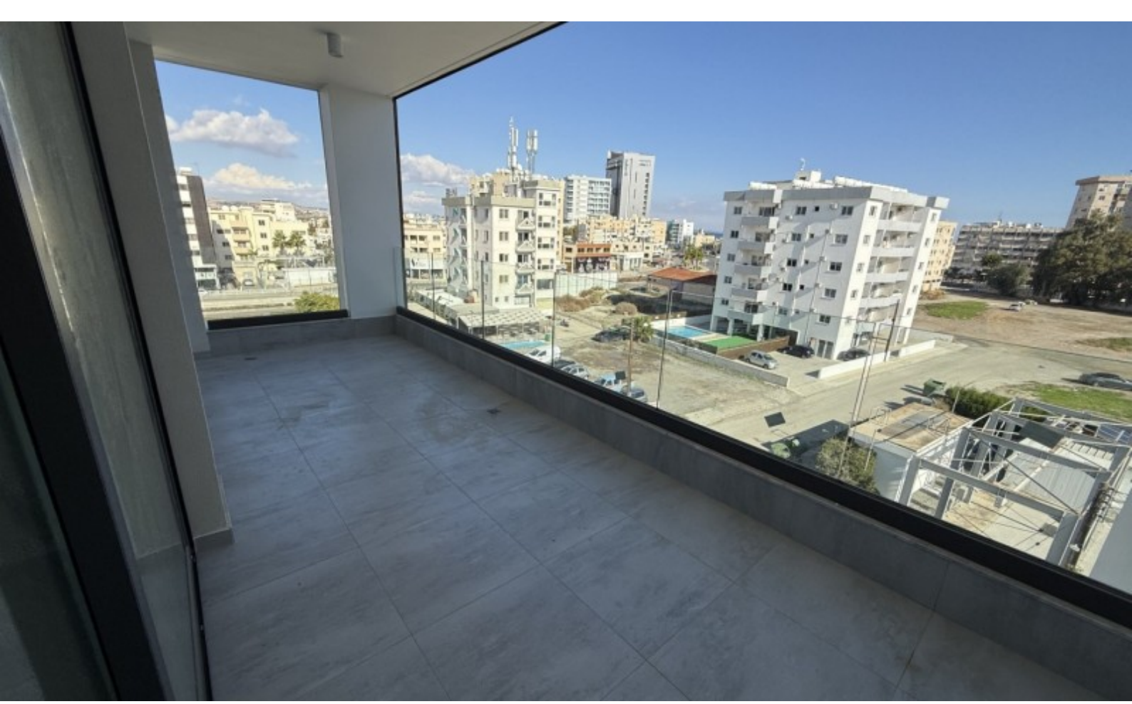
Contact us for full information and a private viewing!