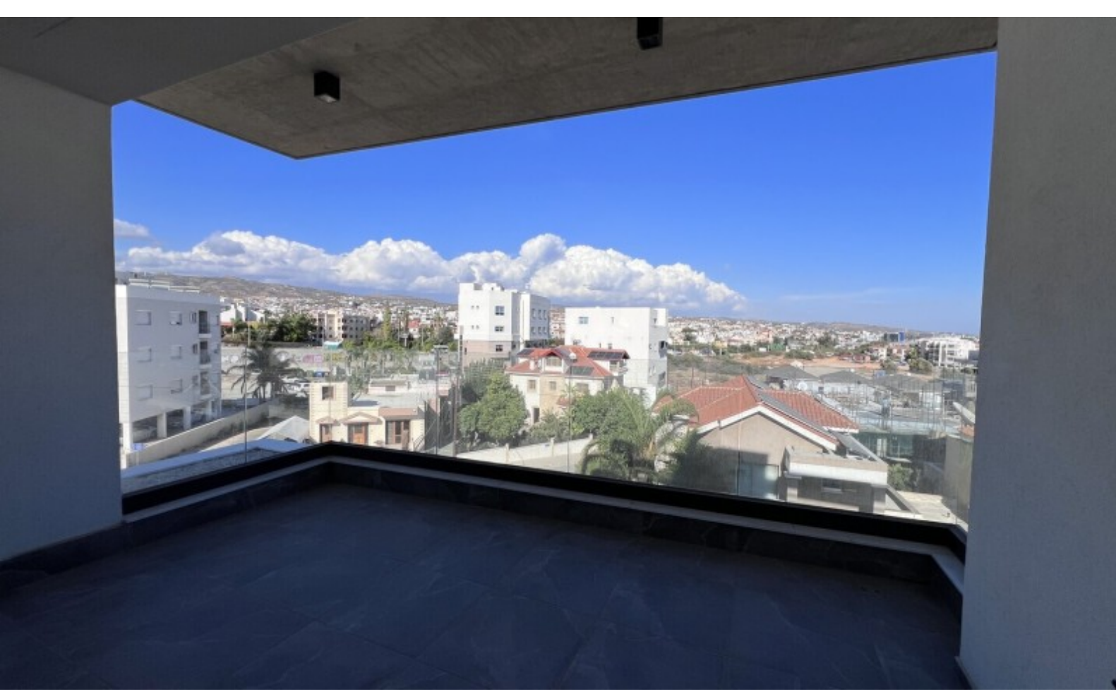
Contact us for full information and for a private viewing