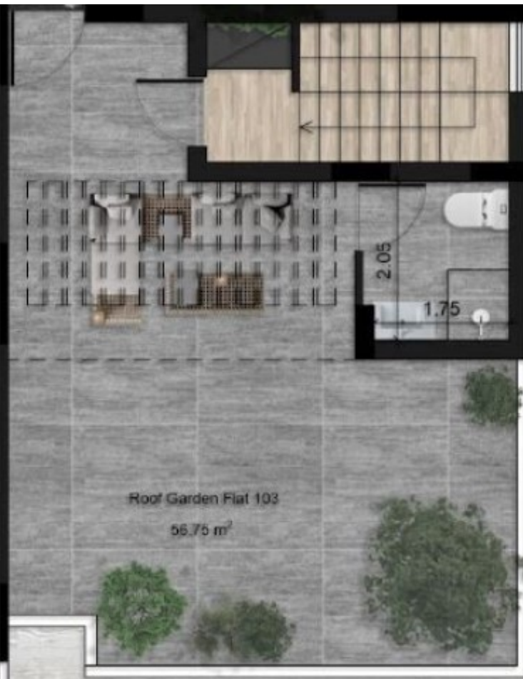
Roof Garden Flat 103 56.75 m 2