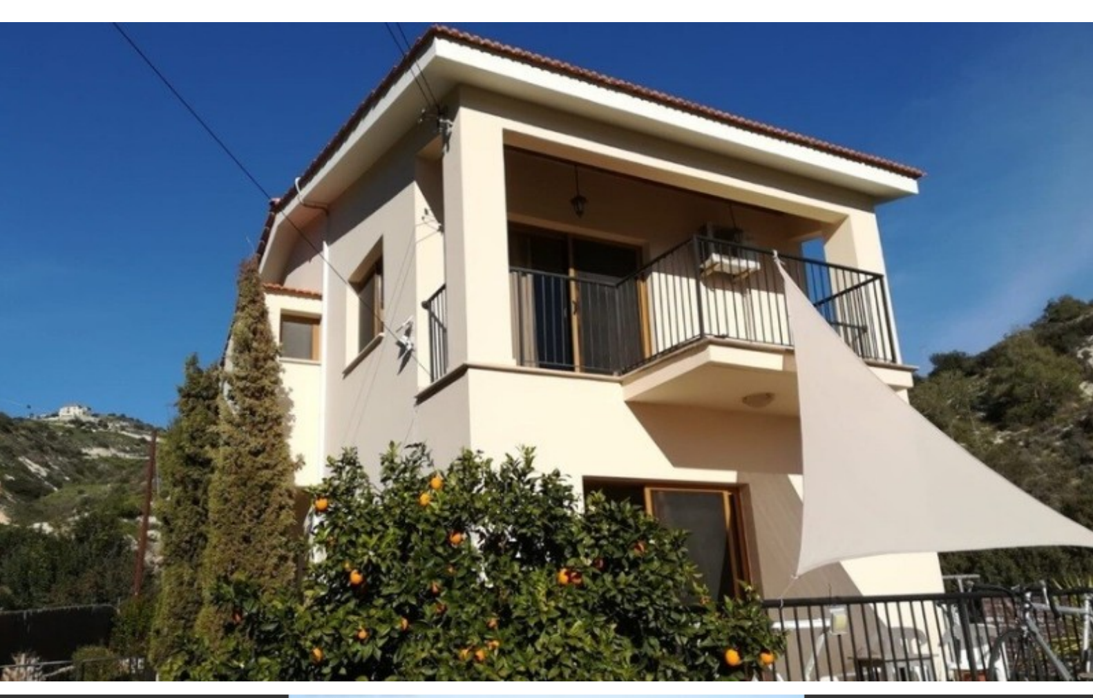
Contact us for full information and for a private viewing!