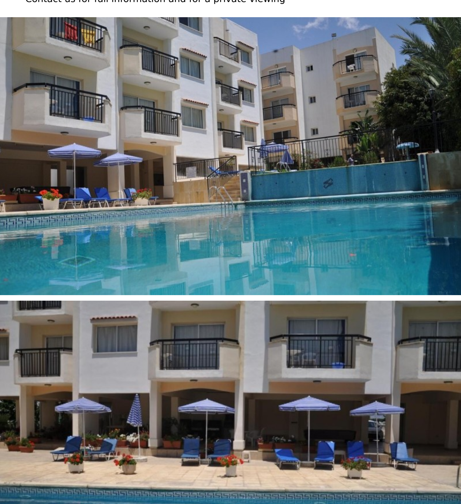
Contact us for full information and for a private viewing