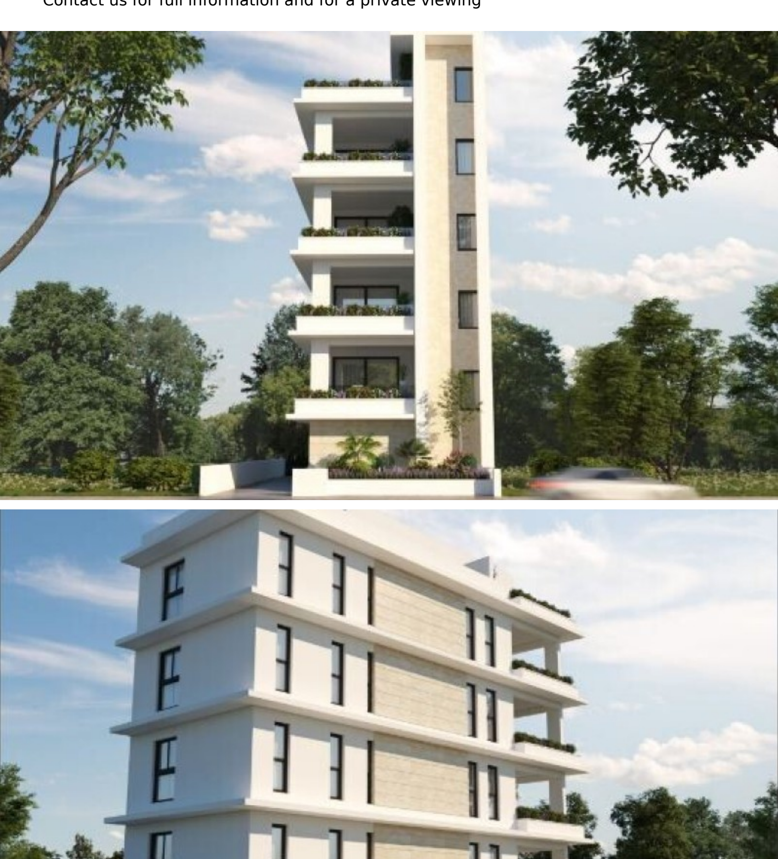
Contact us for full information and for a private viewing