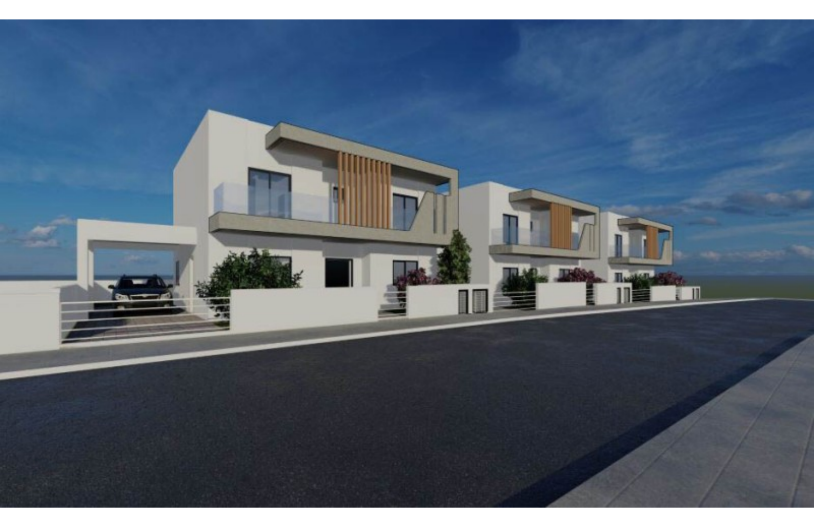
This fantastic home is excellent for a family for permanent living Contact us for full information and for a private viewing!