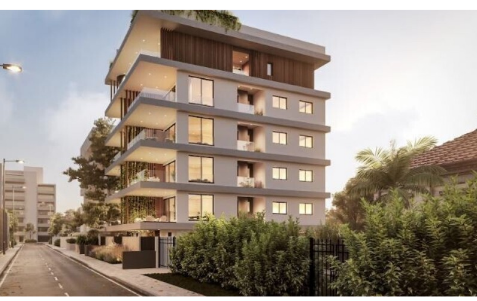
Contact us for full information and for a private viewing