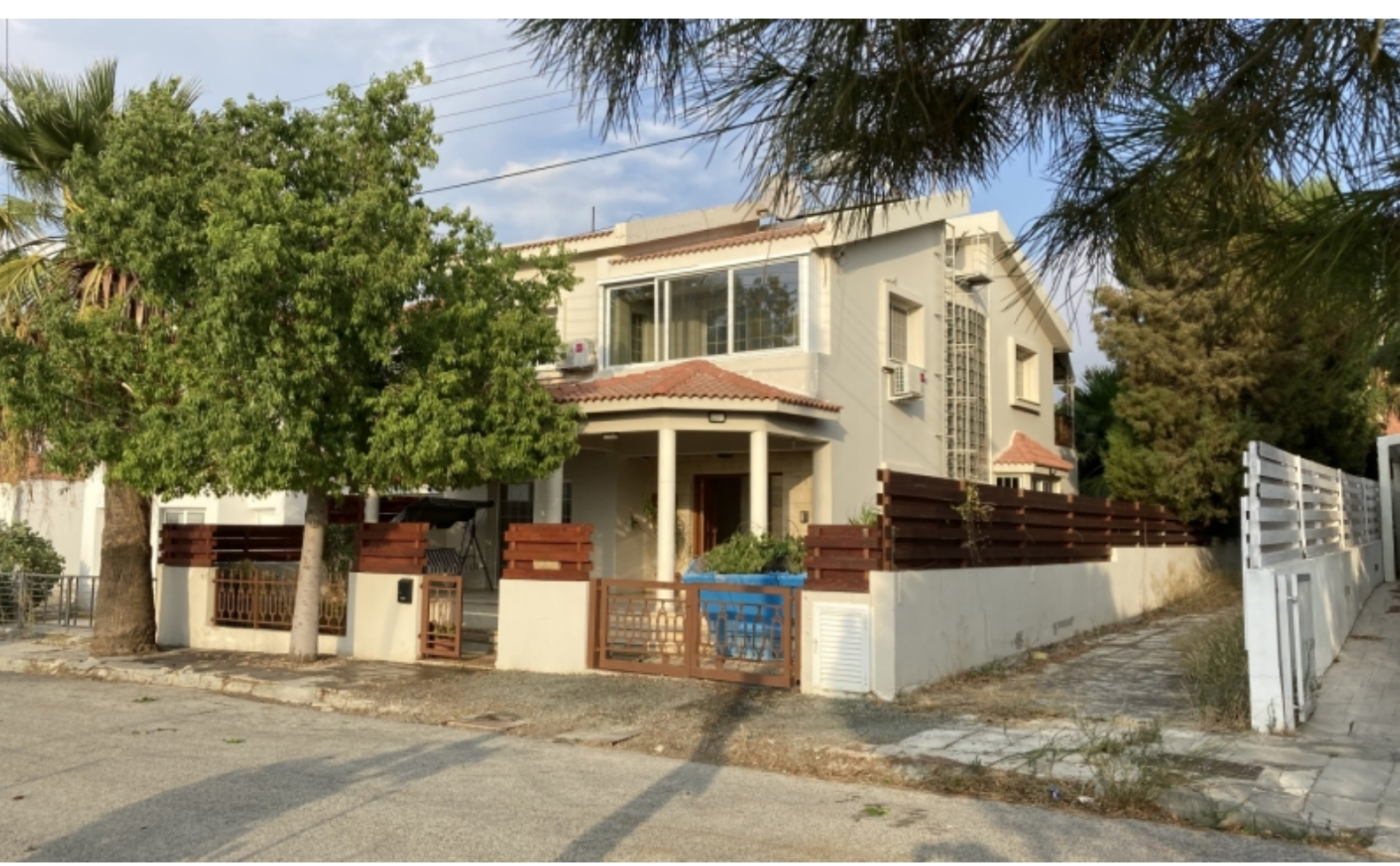
Contact us for full information and for a private viewing!