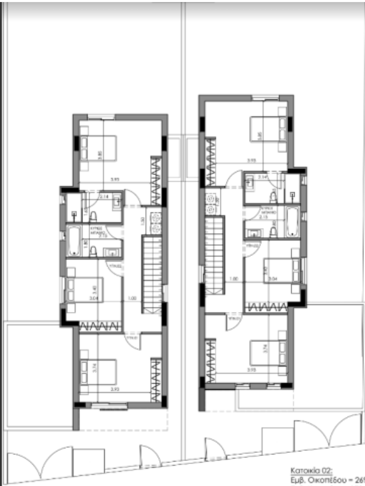
Κατοικία 02: Εμβα. Οικτι6ου = 269