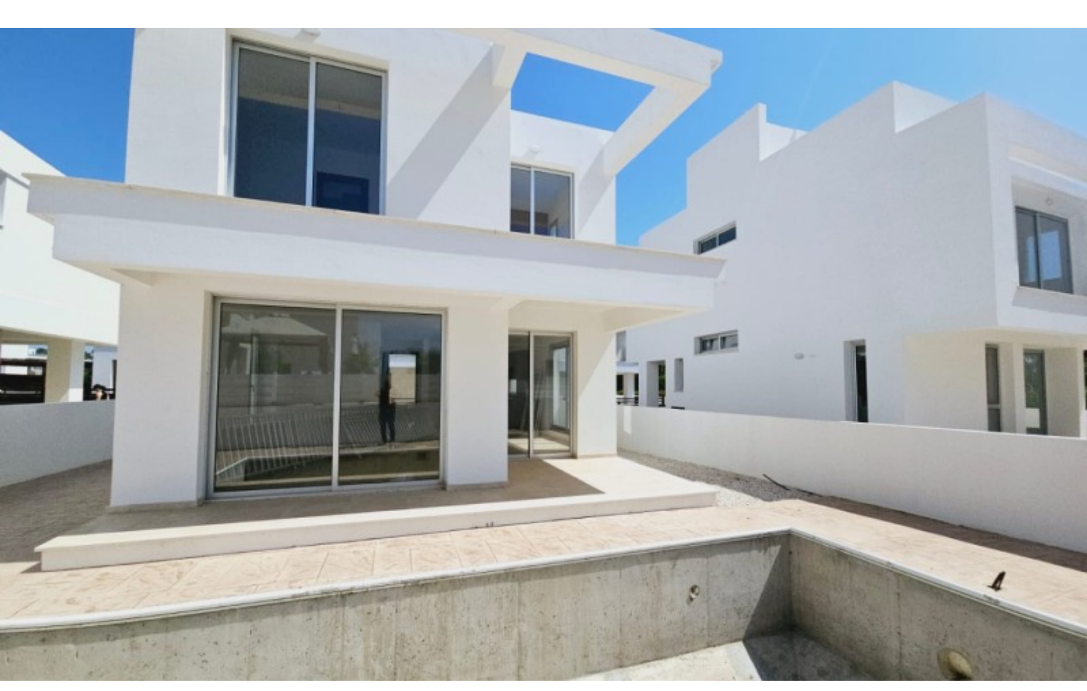
Contact us for full information and private viewing