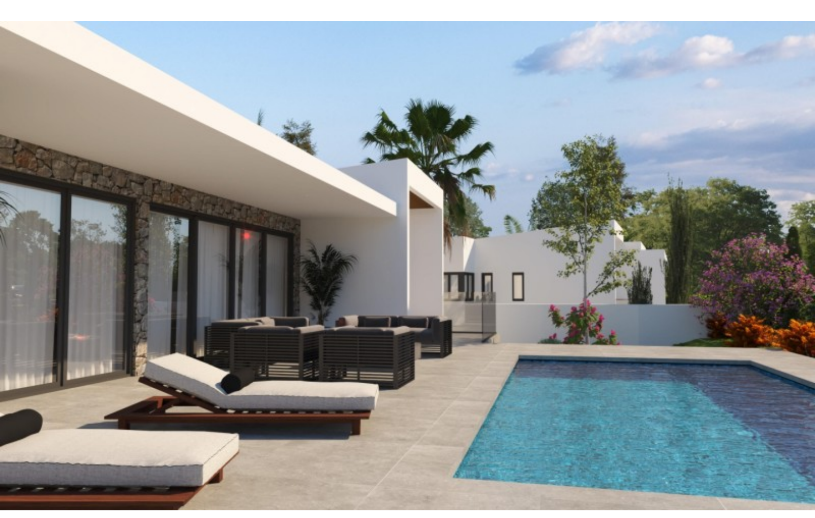
Contact us for full information and a private viewing