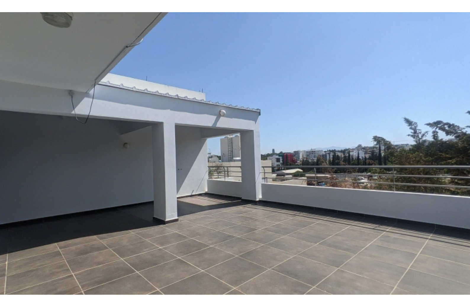
It is excellent for permanent living for a family Contact us for full information and a private viewing