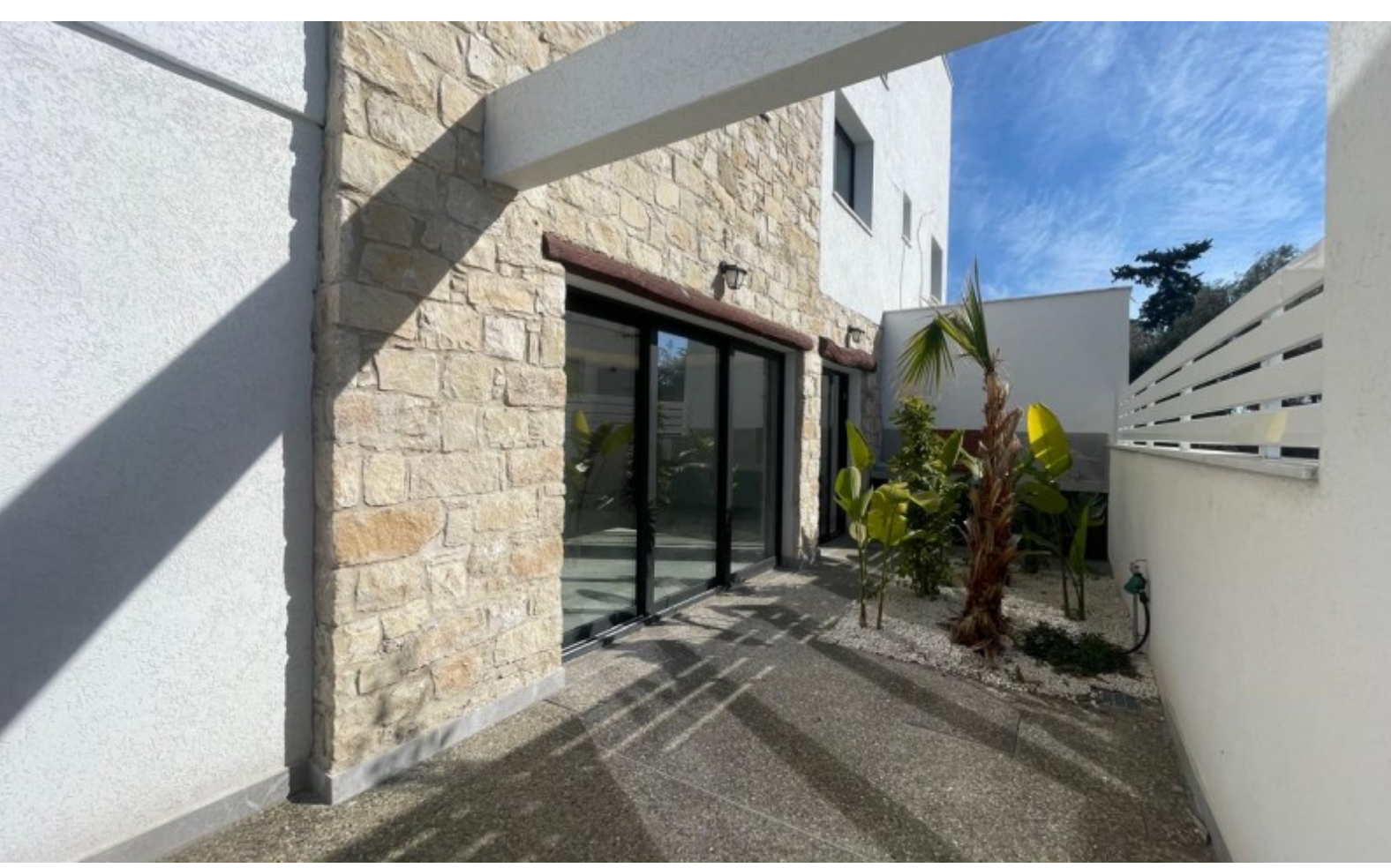
Contact us for full information and a private viewing!