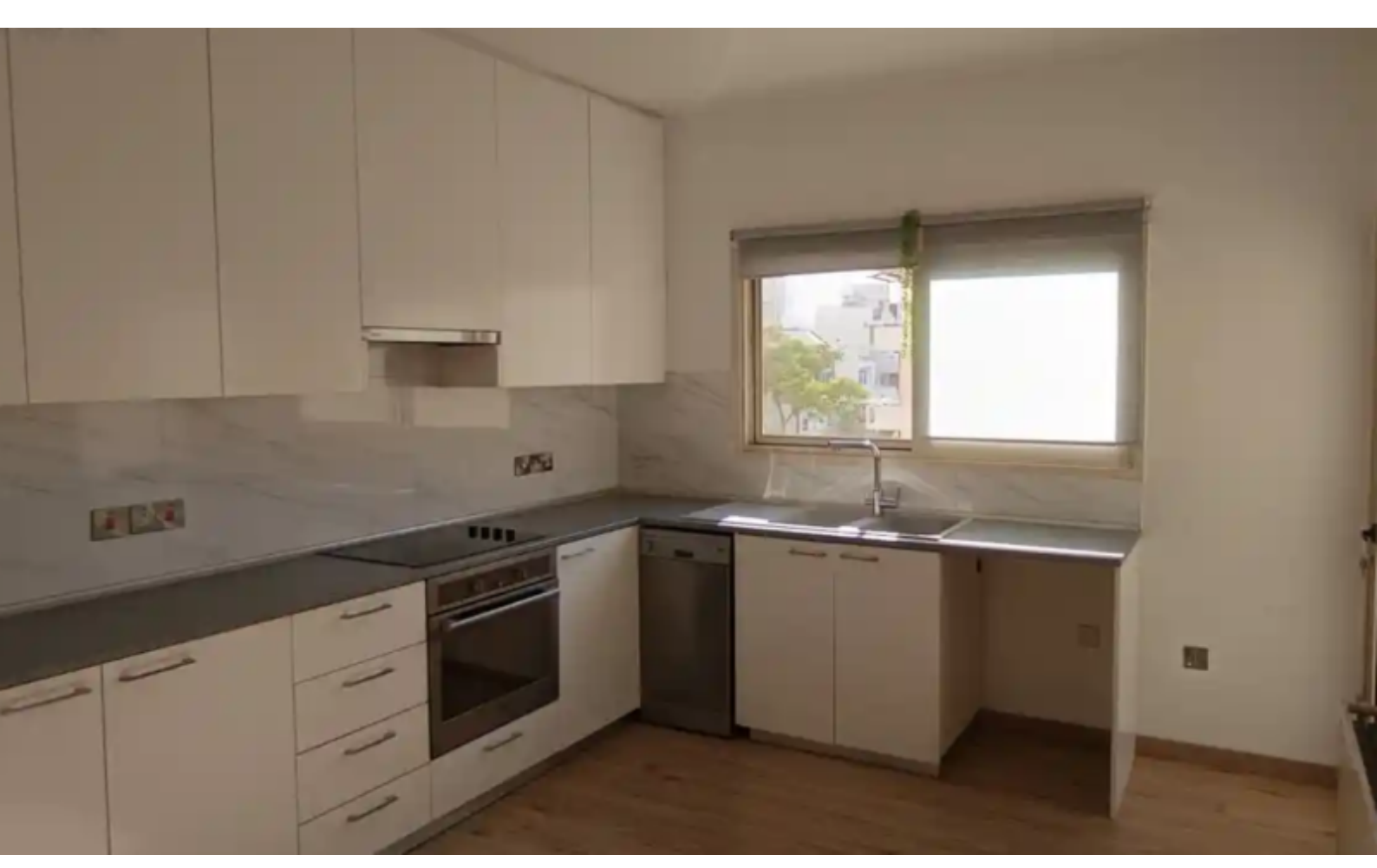
Contact us for full information and a private viewing!