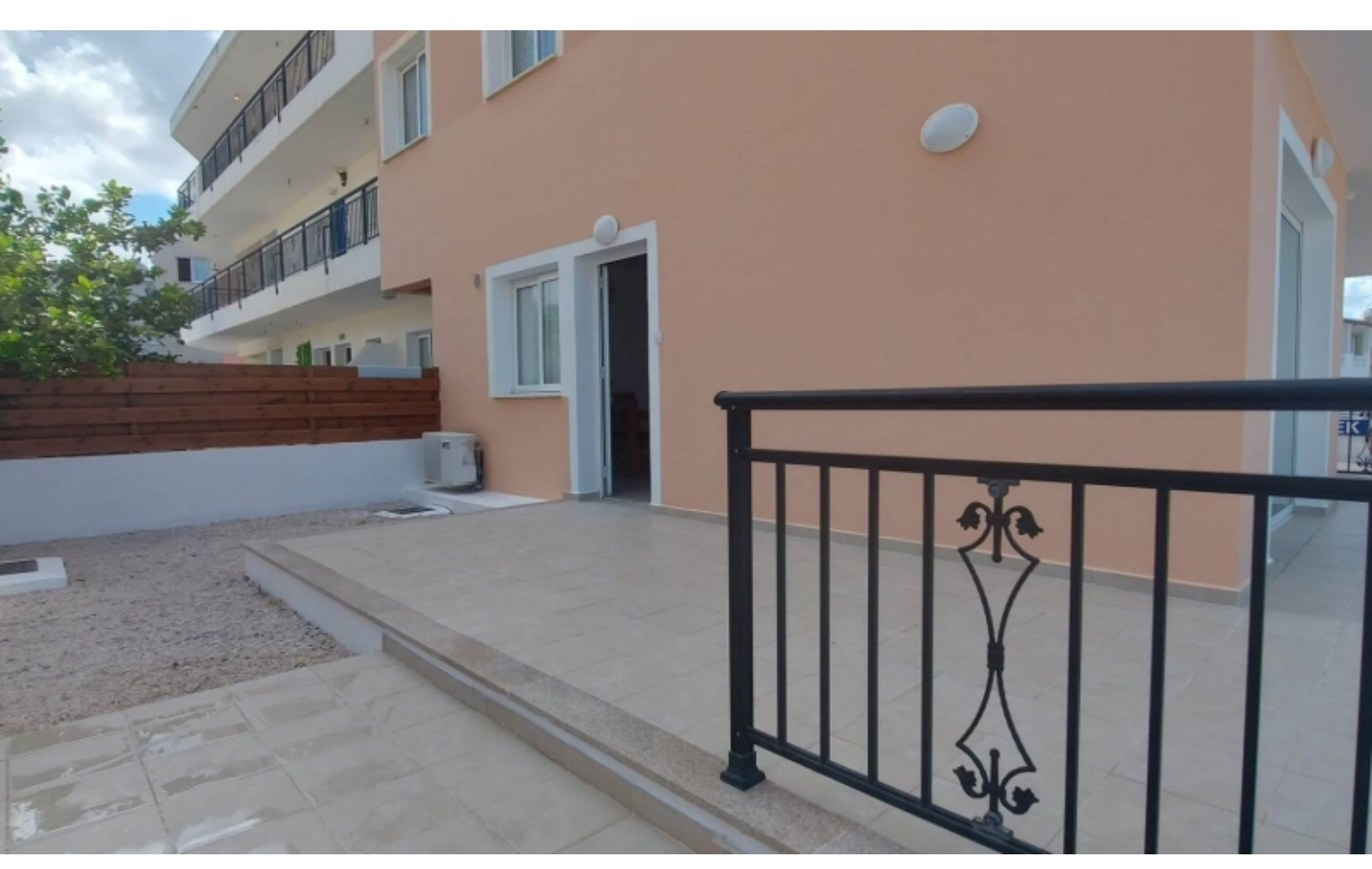
Contact us for full information and a private viewing