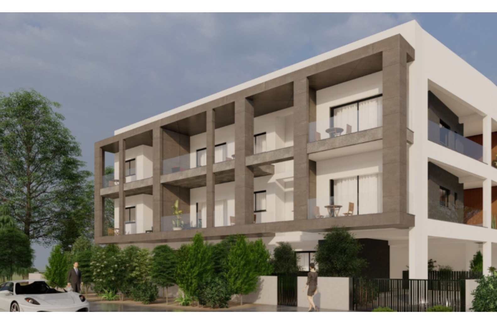
Contact us for full information and a private viewing!