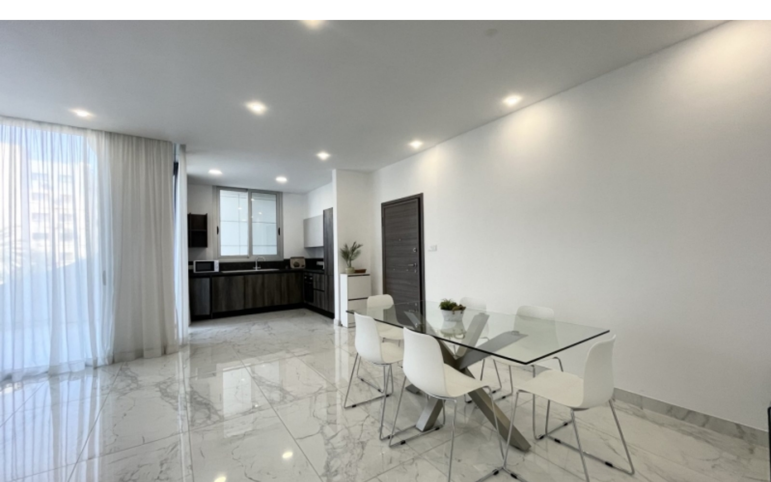
Contact us for full information and for a private viewing!