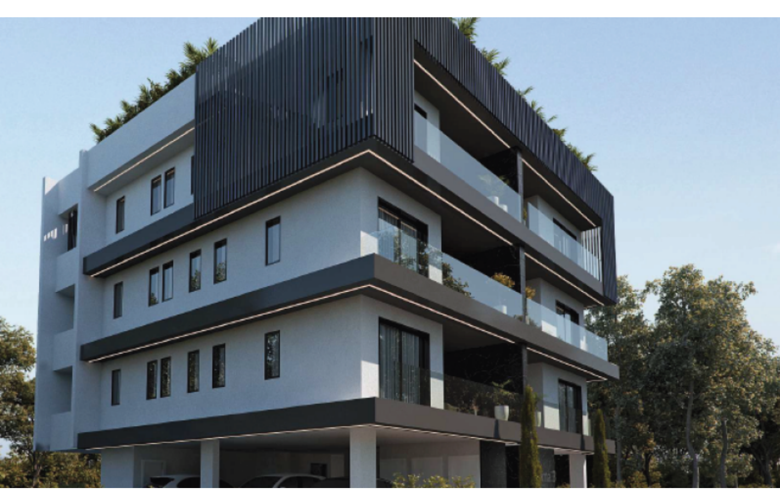
Contact us for full information and a private viewing