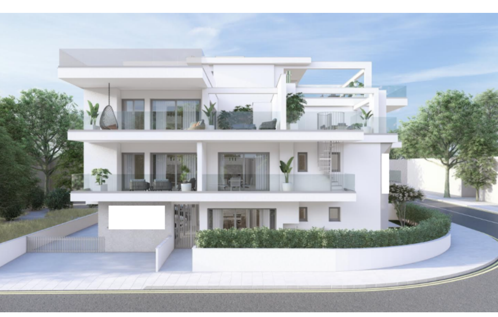
Contact us for full information and a private viewing