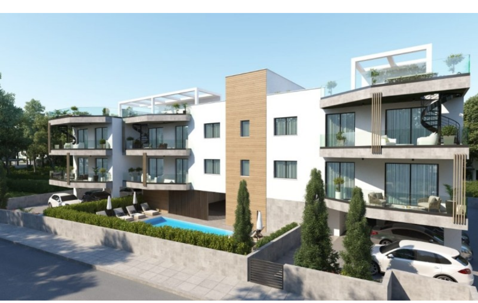
Contact us for full information and a private viewing!