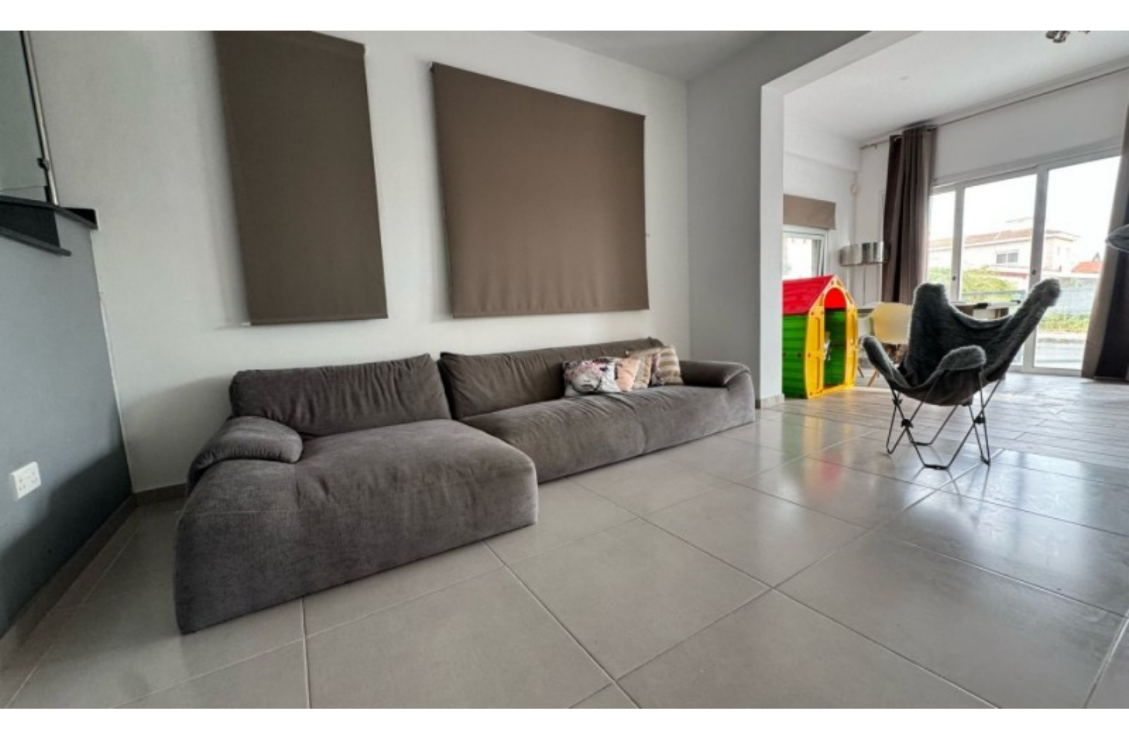
This home is suitable for a family for permanent living Contact us for full information and a private viewing!