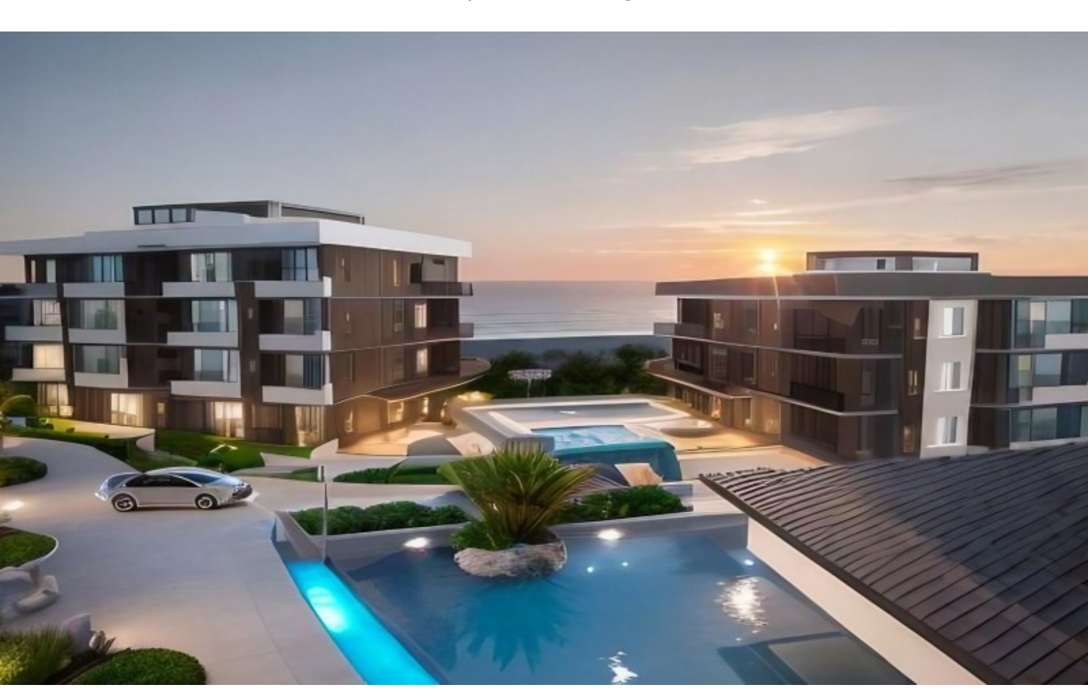
Contact us for full information and a private viewing!